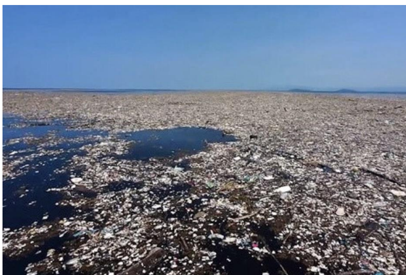
Fig. 1. The Great Pacific Garbage Patch (stock photo).

Understanding the Plastic Crisis. Plastic production has skyrocketed in recent decades, with global annual production reaching over 260 million tons. A big portion of these plastics ends up as waste, polluting the environment. Micro-plastics, tiny plastic particles less than 5 millimeters in size, have become ubiquitous, found in oceans, air, food, and even human excrement. These microplastics originate from the disintegration of larger plastic items, microfibers from clothing, and various other sources.